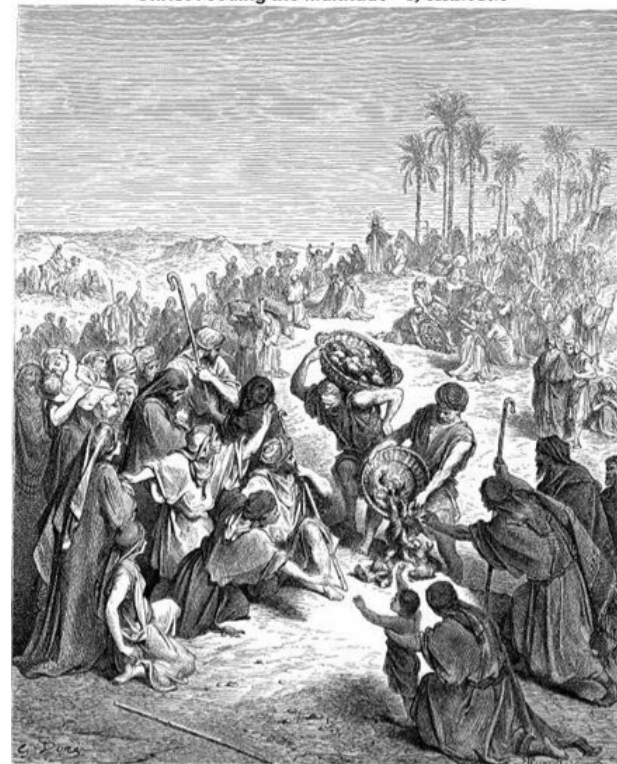
"Christ Feeding the Multitude" by Gustave Doré