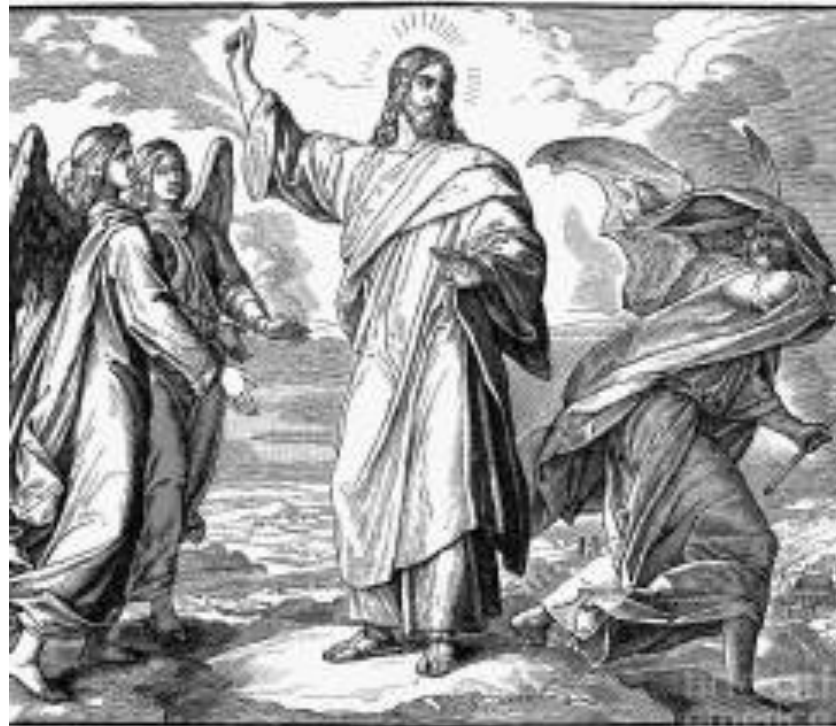
SAVAN THUMPS JESUS.