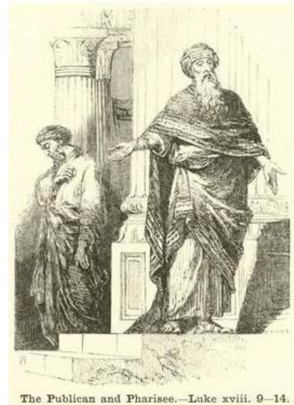
The Publican and Pharisee.—Luke xviii. 9—14.