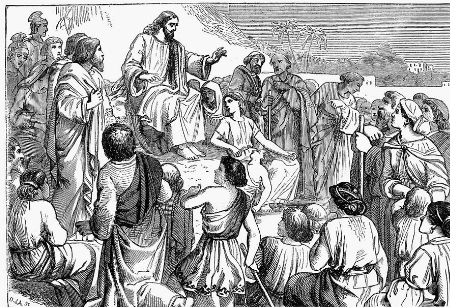
JESUS TEACHING ON THE MOUNT.